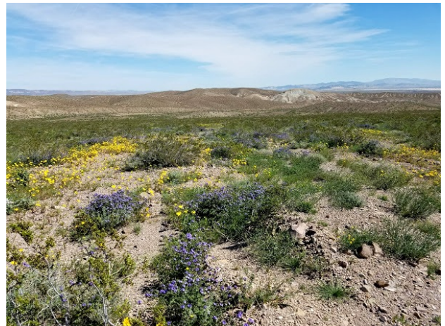
Photos from our Mule Canyon trip